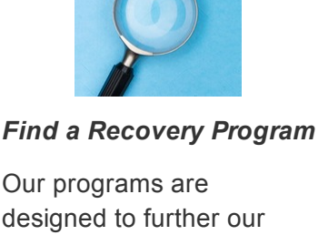
mission and provide muchneeded services for the

community. Find a place to get help NOW.