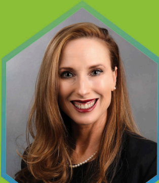
Sen. Holly Thompson Rehder Missouri Senator District 27